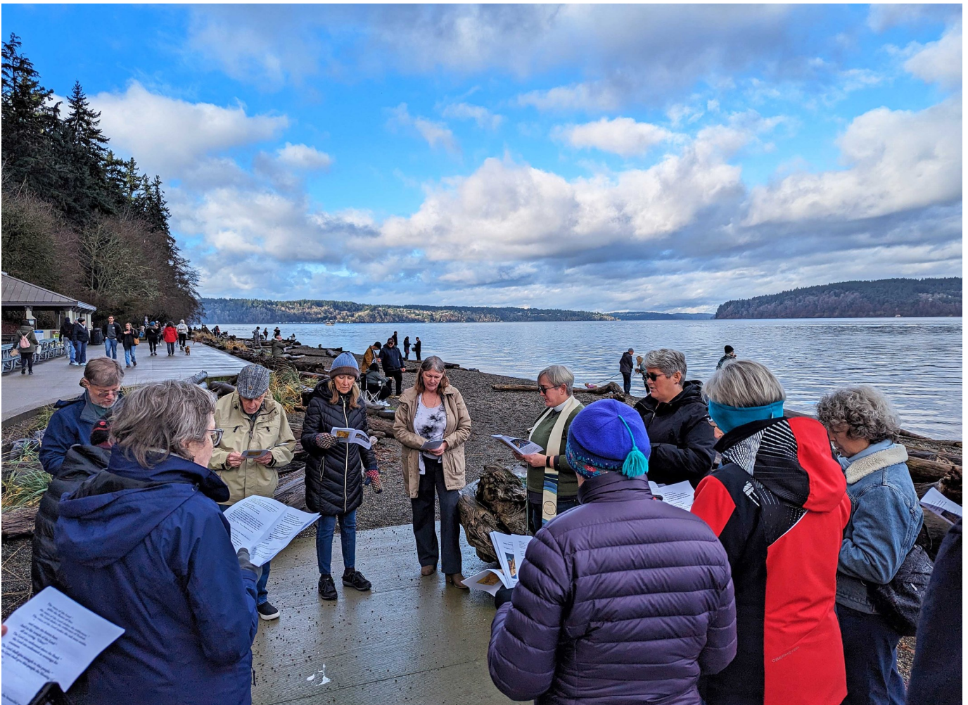
Christ Church blessing circle singing the liturgy at Owen Beach on Epiphany, January 6

~Don Johnson and King Schoenfeld, photo credits to Don and King