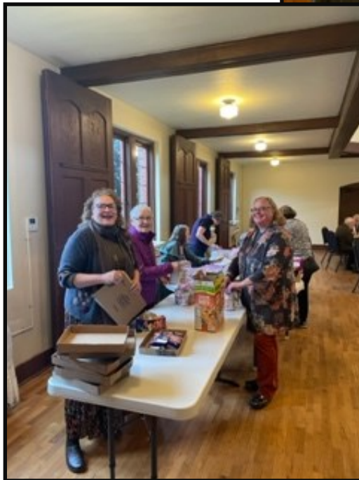
Food Packs being assembled, above, and left.