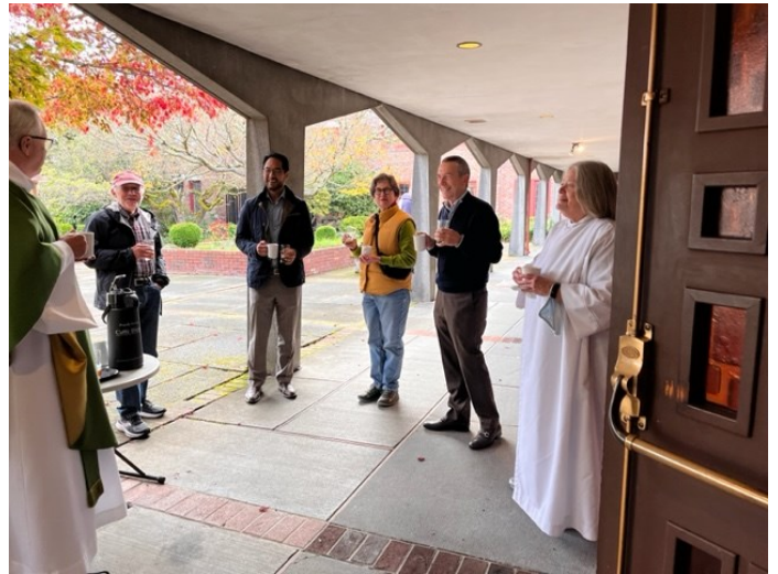
The 8:30am tasters enjoying community at Christ Church!

Worshippers at the 8:30 Holy Eucharist not only enjoy a cup of coffee or tea, but have become tasters for one of our member's emerging beer brewing work. And do we love to chat! Join us for a good time in church! (Note that there is no 8:30am service this Sunday, November 5.)