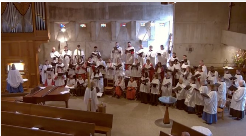
The Royal School of Church Music West appeared at Christ Church on July 2, 2023.