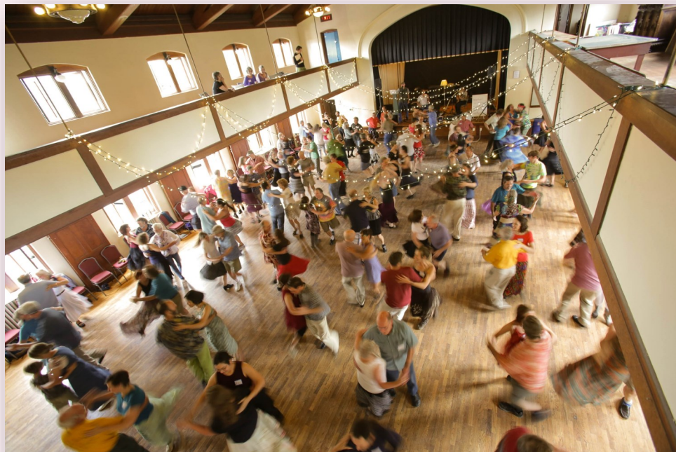
Tacoma Contra Dancers in Wells Hall

Dance Society, a non-profit organization. Our website, http://tacomacontradance.org , has good photos and videos.