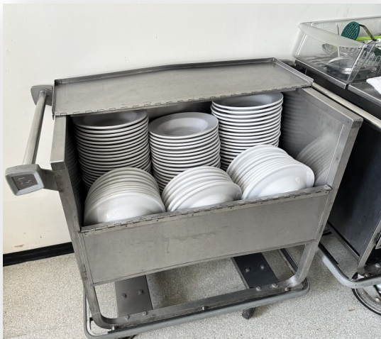
New soup bowls have been unpacked and put perfectly in place, (above) and serving bowls are now all neat and tidy (right).