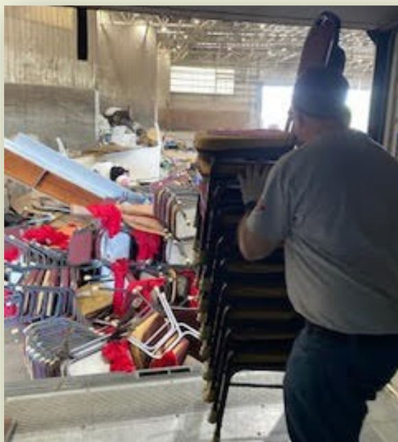
The very last of the red chairs is sent on its way.