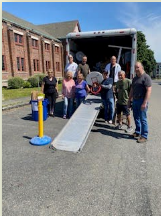
The Wells Hall Work Crew on June 24