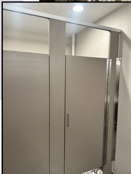
Above: The Ladies Room dividers as they are installed, and the completed bathroom.