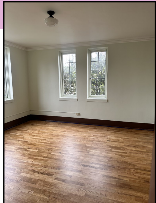
Above: The Green Room remodel is complete, with new heating, new walls, new moulding, new paint, new lighting fixture, and refinished floors. Furniture will return as soon as possible. (Note: it really is greener than this photo shows.)