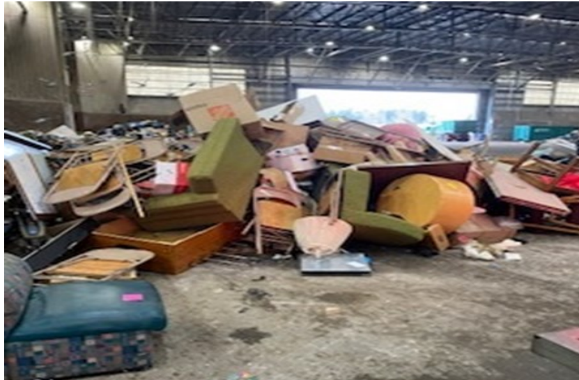
The first load of 5,200 pounds of broken and unused items.

The Wells Hall Work Party was an incredible success!! Thirty parishioners and three members of St. Luke's Episcopal Church pitched in to bring Wells Hall closer to her former glory.