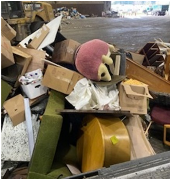
The Pledge Hog goes to his new home.