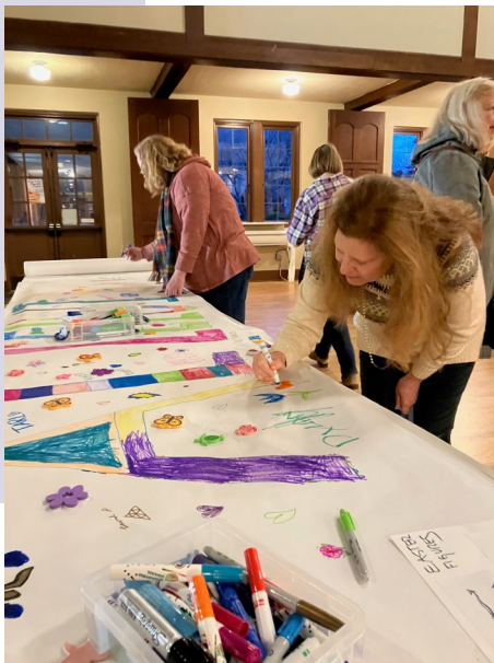
Signing the Alleluia Banner