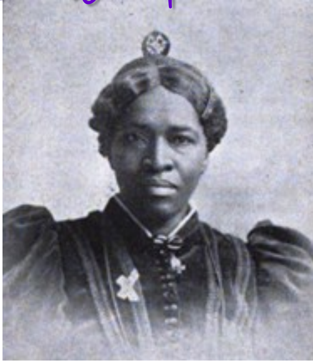
Amanda Berry Smith, evangelist, missionary to Africa, and founder of an orphanage and school for Black children.

Upon her return to the United States, the memory of her exclusion from white schools prompted her to fulfill a long-time dream. With assistance from Black women in the United States and Great Britain, she established a school in the Chicago suburb of Harvey. It was called the Amanda Smith Orphanage and Industrial Home for Abandoned and Destitute Colored Children. For a number of