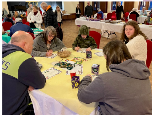
Mardi Gras Family Games