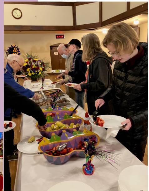
Shrove Tuesday pancakes, sausage, and fruit are enjoyed by all.