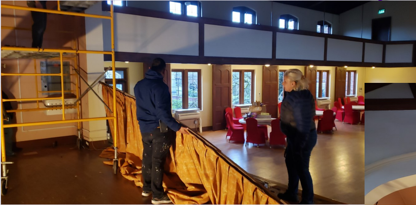
Wells Hall Renovation Updates this week...