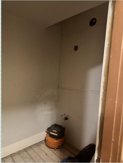
The drywall process begins.