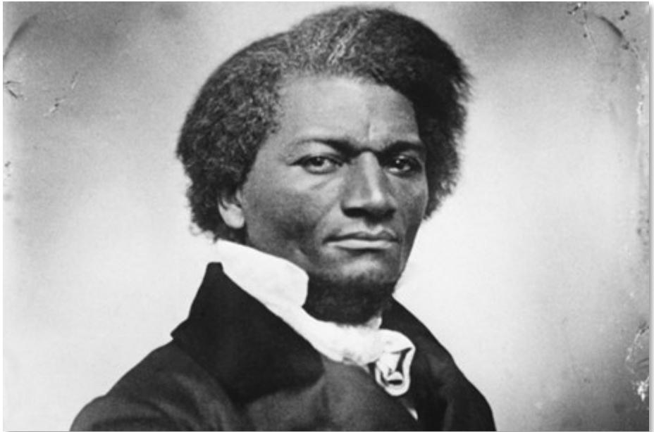
Frederick Douglass, American orator, abolitionist, writer, and statesman.

ed him as a kindred spirit without one trace of condescension. Douglass died in 1895.