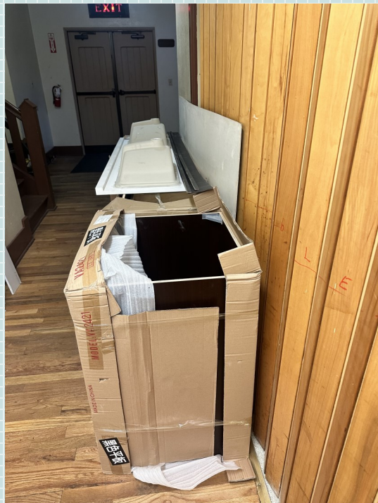
Sinks and cabinets have arrived and are waiting for their chance to be installed.