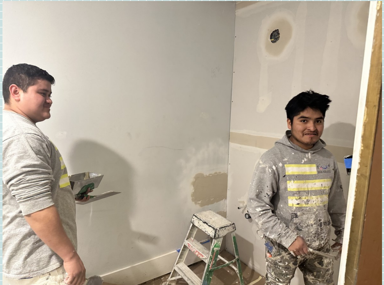
Drywall guys finishing the downstairs ladies bathroom.