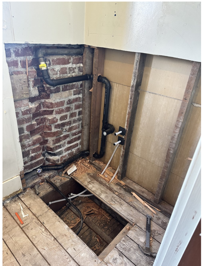
Second floor bathroom, showing new pipes and the old flooring.