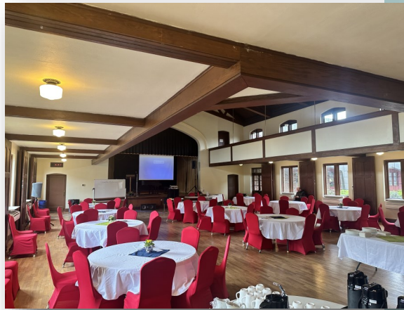
Wells Hall, just before our Annual Meeting began.

We packed our newly cleaned and painted Wells Hall last Sunday and what a gathering it was! The energy in the room was palpable. I experienced a pervasive sense of hope, animated by our senior warden's presentation on what has happened among us over the past year. So many good initiatives and so much incredible generosity from Christ Church members and friends now orient us toward a future marked by hope .