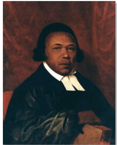
The Rev. Absalom Jones, the first Black priest in the Episcopal Church.

In 1787, Jones and his friend, Richard Allen, organized the Free African Society, a group of Black Christians who opposed the segregation of Blacks from Whites in worship. In time, this group of Black Philadelphians established a church and applied for membership in