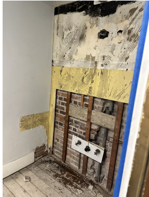
Ladies Room without the mirror and sink, and now the flooring has been removed.