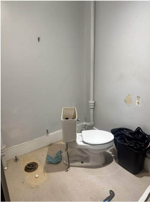
Out with the old...this is the ladies room on the ground floor before they remove flooring.