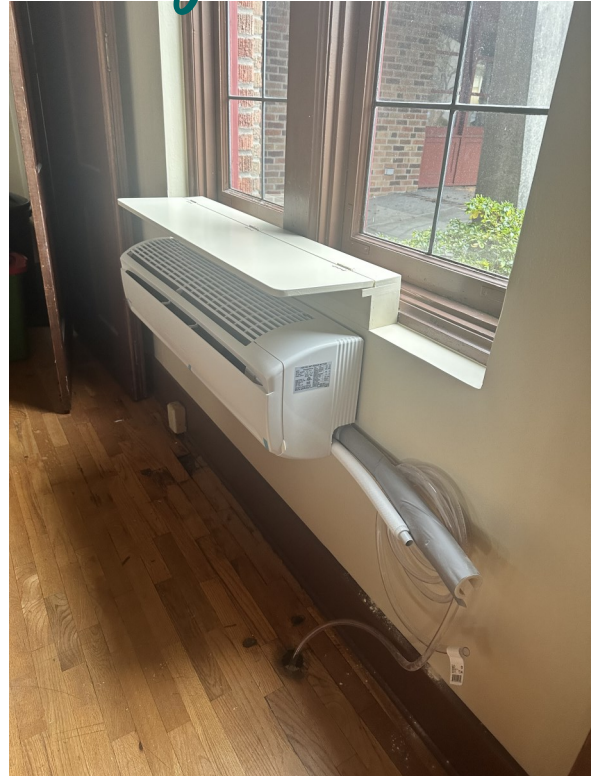
New heating/cooling unit uses former radiator locations.

Where to begin...Wells Hall has been a very busy place these past few weeks. The radiators for steam heat have all been removed and 11 new heating/cooling units have been hung below windows in the same locations as the radiators. The new units are ready to be hooked to power and the outside units. We are waiting for fencing before the outside units can be delivered. The outside units are very similar to the one on the roof of Trinity House, so initially it will be a shock to see them in the corner of the courtyard. They need to be fenced to prevent vandalism as well as to protect all the copper