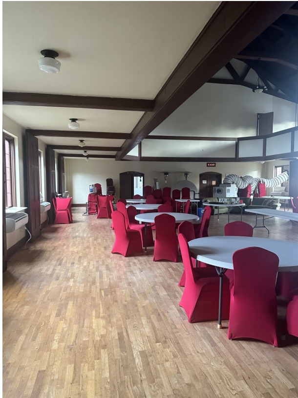
Freshly-painted Wells Hall, in preparation for a busy weekend of events.

from thieves. Once they are in place, we will work on how best to blend them in with the rest of courtyard.