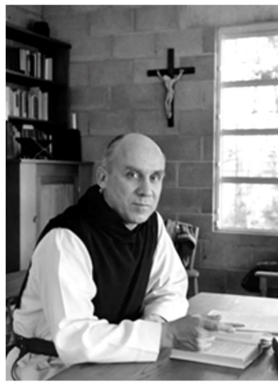
Thomas Merton, OCSO

T homas Merton, OCSO, the New York journalist turned Cistercian monk, was a keen observer of two things: the feasts and seasons of the church year and their significance for modern Americans. Merton did not view Christmas as a colorful time filled with parties and lively music, in and outside of church (though he was not in any way opposed to parties and music). Rather he recognized in the Christmas Mystery what becomes apparent in the life of the adult Jesus: his companionship with those who do not fit into society's understanding of who is "acceptable" and "unacceptable."