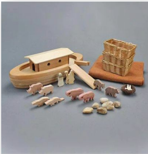
Ark and the Flood $341.95

Examples of materials that are available on our Wish List.