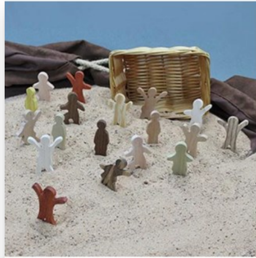
People of God $53.95 $58.90

thoughts, ideas and feelings about the story through expressive art following the presentation..."